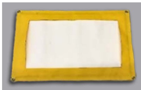
Mini berm with Geo-Absorb

Geo-Absorb is an affordable and quality-controlled absorbent that is recommended for standard drips and spills. It provides a long-lasting absorption capacity to protect the work environment and ensure it remains compliant and safe. When combined with a geomembrane, Geo-Absorb can also act as a mini berm.